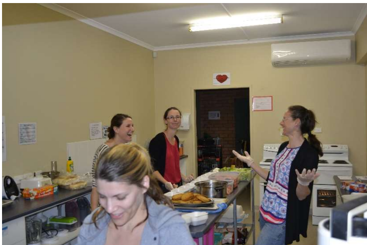
Family Fun Fair – Parent Helpers

Wednesday. Parent teacher nights are held at the end of each semester and our “News Break” evenings are open classroom/social events held at the beginning of each term.